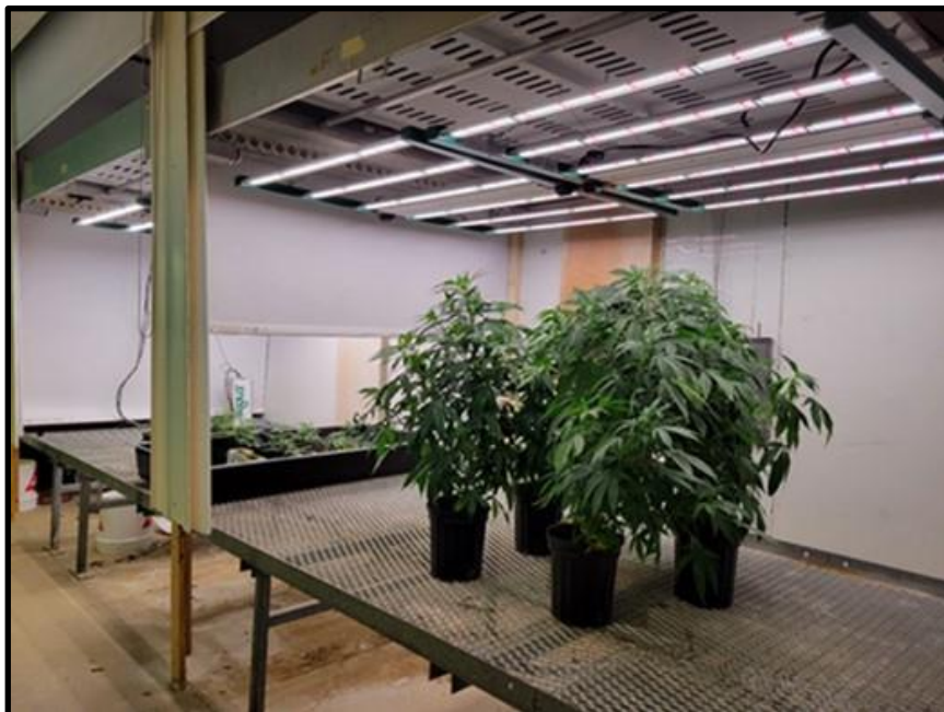
Figure 1 Walk-in growth chamber for conducting cannabis lighting research. Six compartments each have pairs of height-adjustable, dimmable LED fixtures (Jungle – LED G4i 1200, Allstate Garden Supply) and are divided by opaque blinds.

Our main experimental objective was to investigate the critical photoperiod for inducing flowering in clones from different drug-type, indoor-grown cannabis cultivars. We used a 10 x 25 ft walk-in growth chamber that was divided into 6 individual compartments using moveable opaque vertical blinds and a central walkway. The floor is bare concrete and benches were made of expanded metal. Figure 1 shows the general setup of the compartments with benches, LED fixtures, and dividing curtains.